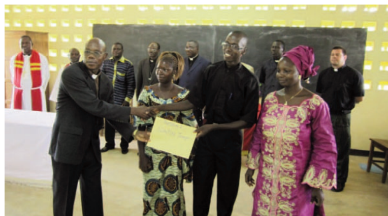
Burkinabe student receives certificate