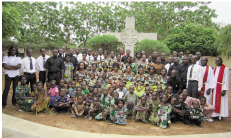
The CLET Community (some missing)

Throughout the ceremonies, I could not help but think about the importance of what was happening. We are encouraged to pray that the Lord of the Harvest send workers out into the fields ripe for harvest – and they are so ripe in Africa! (Africa, if it is not already, will soon be the “center” of Christianity.) This has been the prayer of decades’ worth of missionaries in French-speaking Africa. What happened on June 18 was yet again an answer to this all-important prayer! The Lord of the Harvest was and continues to be at work through the CLET. ■