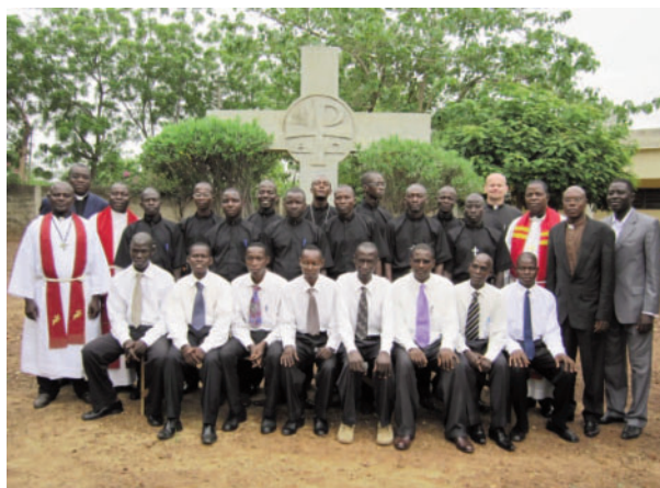
CLET Students with Staff and Visitors

The CLET is organized into two programs: 1) The